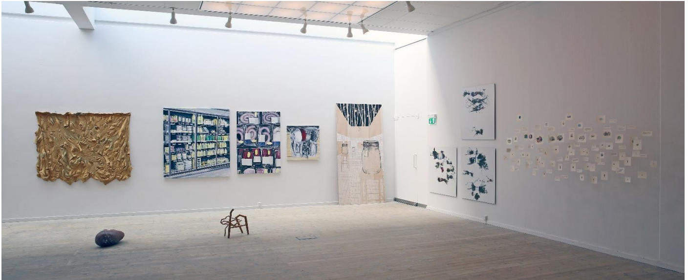
View from KP17 in Kunsthal Aarhus – click on the image to see more from KP17

Apply for The Artist Easter Exhibition in Kunsthal Aarhus, Denmark. Online application January 13 th – February 13 th at www.kp-spring.dk